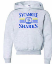
Blue & yellow Sycamore Sharks Imprint on ash unisex hooded sweatshirt