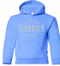
Silver glitter Sycamore Valley Sharks Imprint on carolina blue hooded sweatshirt