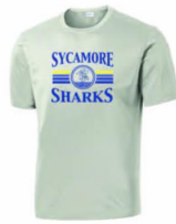
Blue & yellow Sycamore Sharks Imprint on silver moisture wicking unisex t-shirt