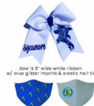
Bow is 3" wide white ribbon w/ blue glitter imprint & elastic hair tie Blue Mask is Size Small (kid/small adult) Grey Mask is Size Medium (large kid/adult)