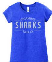
Silver glitter Sycamore Valley Sharks Imprint on royal frost cotton t-shirt