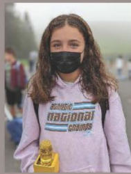
Addison Maybe sweets for dinner and maybe no bedtime.