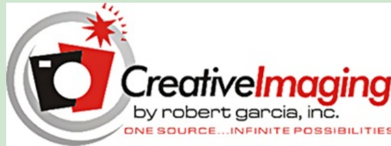
Photo Make-Up and Retakes will be taken on Monday October 25th.

BUY NOW: https://sycamorevalley.futurefund.com/store